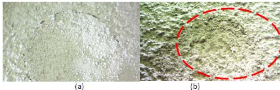
Figure-3. (a) FC + RHA slab surface and (b) FC slab surface after stroke by impactor with 9.9 m/s impact velocity.

The compressive strength of FC with RHA achieved 69.6% greater strength than FC. Figure-3a shows FC under 9.9 m/s impact loading created the radial crack and fragments, means while, Figure-3b obviously fragments were not found in FC with RHA was subjected to impact loading.