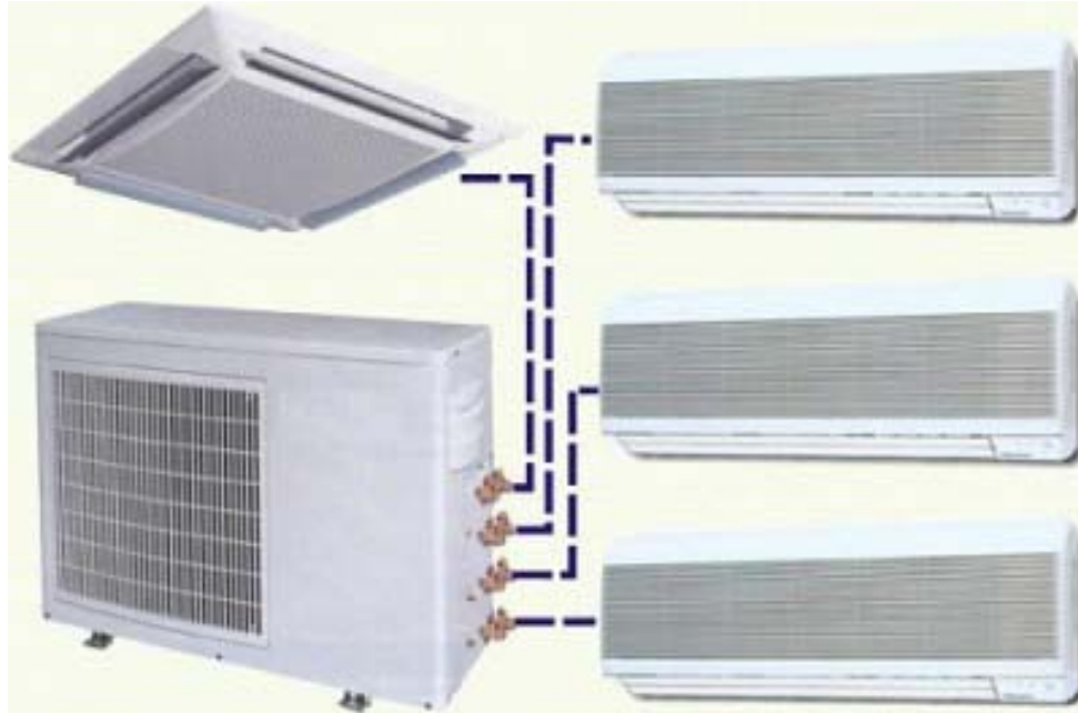
Figure-2. Autonomous ACSs.

This air conditioning system is much simpler (Figure-2).