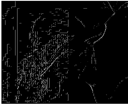
(a) Th = 10