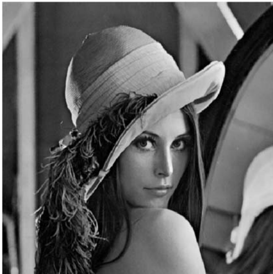
(a) Original image "Lena"