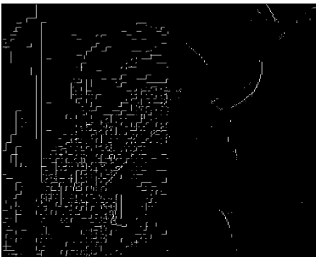
(b) Th = 20