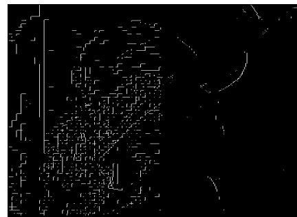
(c) Proposed method ( Th_{g,h}=20 )