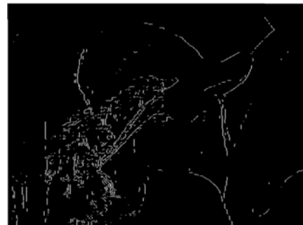
(b) Prewitt detector