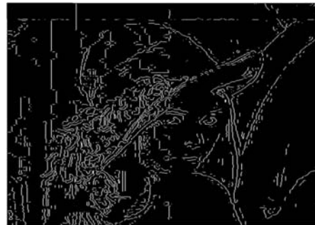
(a) zerocross detector

The zerocross detector and Prewitt detector are performed to compare the performance of proposed method with conventional methods for blocky artifacts detection in compressed image. Both methods are implemented in MATLAB and utilizing default parameter settings.