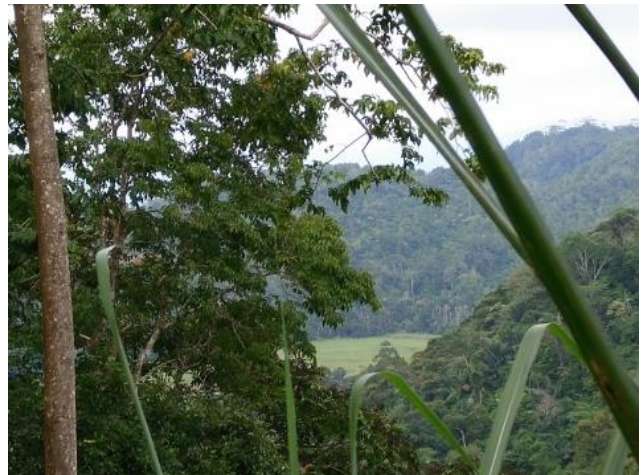
Figure-1. Rawa Lembah Keramat.

Rawa Lembah Keramatis one of potential ground water sources which is suitable to be developed (Figure-1). It's located on the east side of Tidore Island with an altitude of 396 m and can be distributed by gravity after being pumped at appropriate altitude. It is a valley with an area of 11,695,081 m 2 and surrounded by hillsides which lead to it (Figure-2), make it an effective water catchment area.